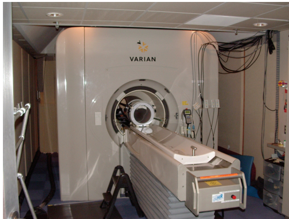
Fig. 3. 4T fMRI, part of the Brain Imaging Center, in: Helen Wills Neuroscience Institute at the University of California, Berkeley

fMRI is used for the study of metabolic and vascular changes that accompany changes in neural activity. The technique is based on the Blood Oxygen Level Dependent method (BOLD), which measures the ratio of oxygenated to deoxygenated haemoglobin in the blood across regions of the brain. As oxygen is extracted from the blood, increases in deoxyhaemoglobin can lead to an initial decrease in BOLD signal. However, this is followed by an increase, due to overcompensation in blood flow that tips the balance towards oxygenated haemoglobin. It is this that leads to a higher BOLD signal during neural activity. fMRI is not a tool that can be easily combined with virtual reality environments. First of all, a test platform has to be developed to allow the exposition to the virtual environment while capturing the fMRI images without altering in a significant way any of both technologies. Moreover, the user has to be inside the magnetic resonance machine in supine position and with minimum head movement, and devices used to navigate and interact in the virtual environment have to work inside high magnetic fields with minimum electromagnetic interference.