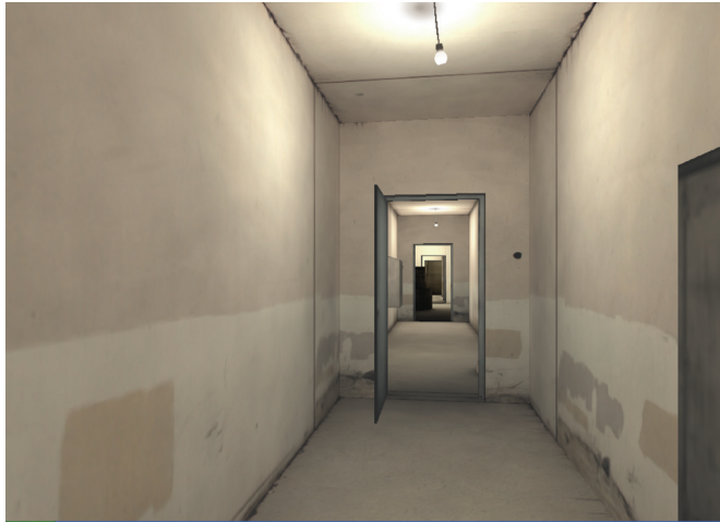
Fig. 4. Image of one of the rooms of the virtual maze that was used in the studies that analyzed presence in virtual environments using TCD

variations were observed in the free navigation condition than in the automatic navigation condition. As in the previous study, the observed differences in MCA-L can have their origin in the motor tasks differences between navigation conditions. On the other hand, a possible explanation of the differences in MCA-R percentage variations between navigation conditions could be found in the higher degree of involvement of the user in the creation of a motor plan in the free navigation condition. Results from questionnaires also found higher values of presence during the free navigation condition.