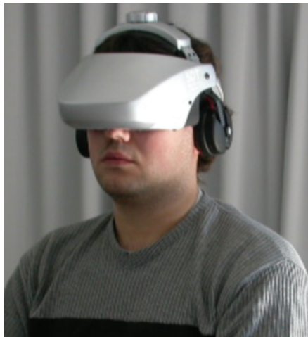
Fig. 1. Subject of a virtual reality experiment wearing a head mounted display

Tarr & Warren (2002) considered that three sources of information were available for this learning process: visual information in the form of optic flow (the pattern of visual motion at the moving), visual information about objects distributed in the environment (which can be used as landmarks) and body senses including vestibular and proprioceptive information. In order to analyze the influence of each of those factors, it is necessary that the subject moves through an environment where the experimenter can manipulate aspects such as the optic flow and the objects that appear in the environment. Virtual reality can be used to generate this controlled environment where the participant can navigate freely.