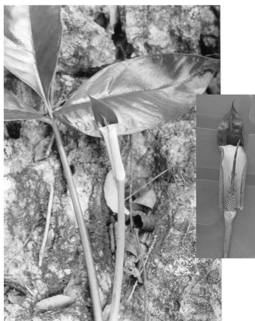
Pictures: Arisaema ramulosum Alderw Habit and femal spadix.